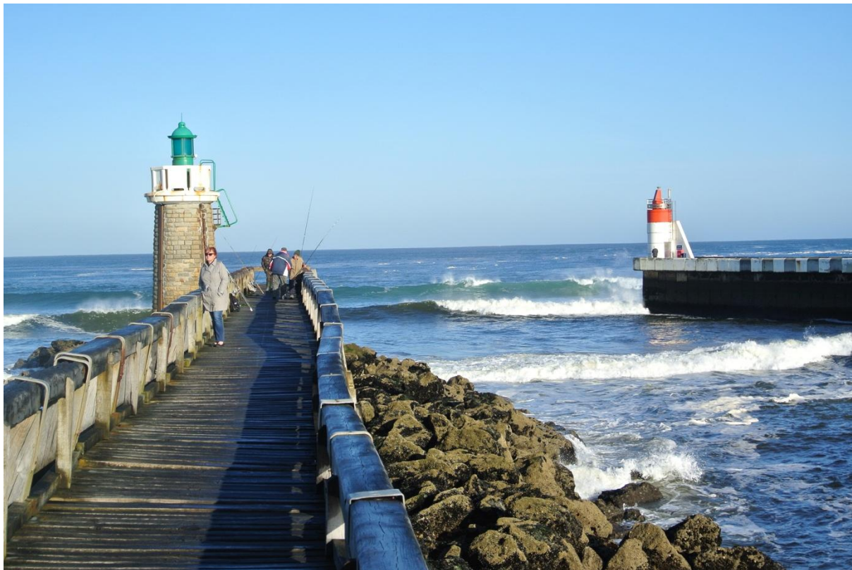
Approach to Capbreton – best to wait a couple of hours!

Now it was time to start heading south towards Northern Spain. We had to first retrace our steps returning to La Rochelle and then Medoc and glad to report performance had been restored.