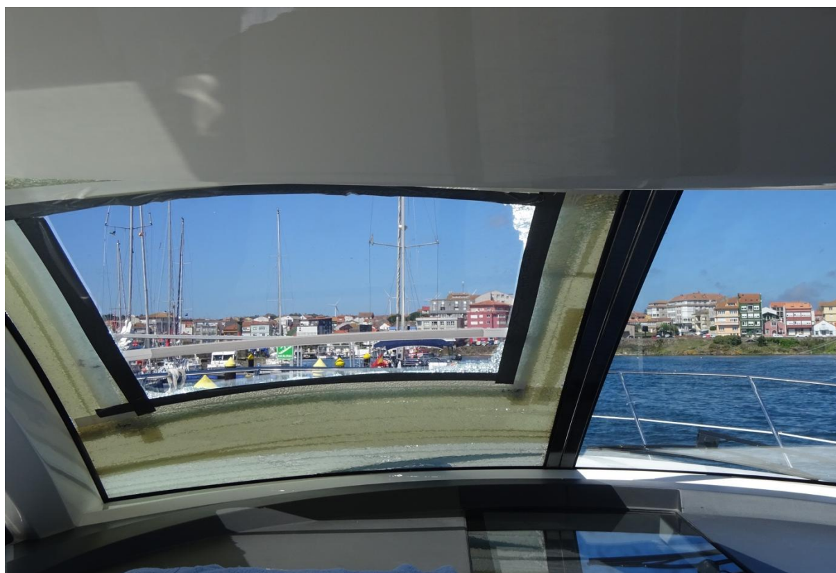
Mark 2 windscreen

So we continued to explore the Spanish Rias in great weather but Lady Luck had not quite finished with us yet. I went to pump out the black water tank en route to Muros and just the sound of air being sucked in. Bottom line the macerator had given up and I suspected more than just an impeller failure. Arrived in Muros a delightful strip down and realised a new macerator was required and onto the internet. The model installed was still available so it was ordered from the UK and in 30 hrs arrived at the marina office. It still amazes me what you can do over the internet these days.