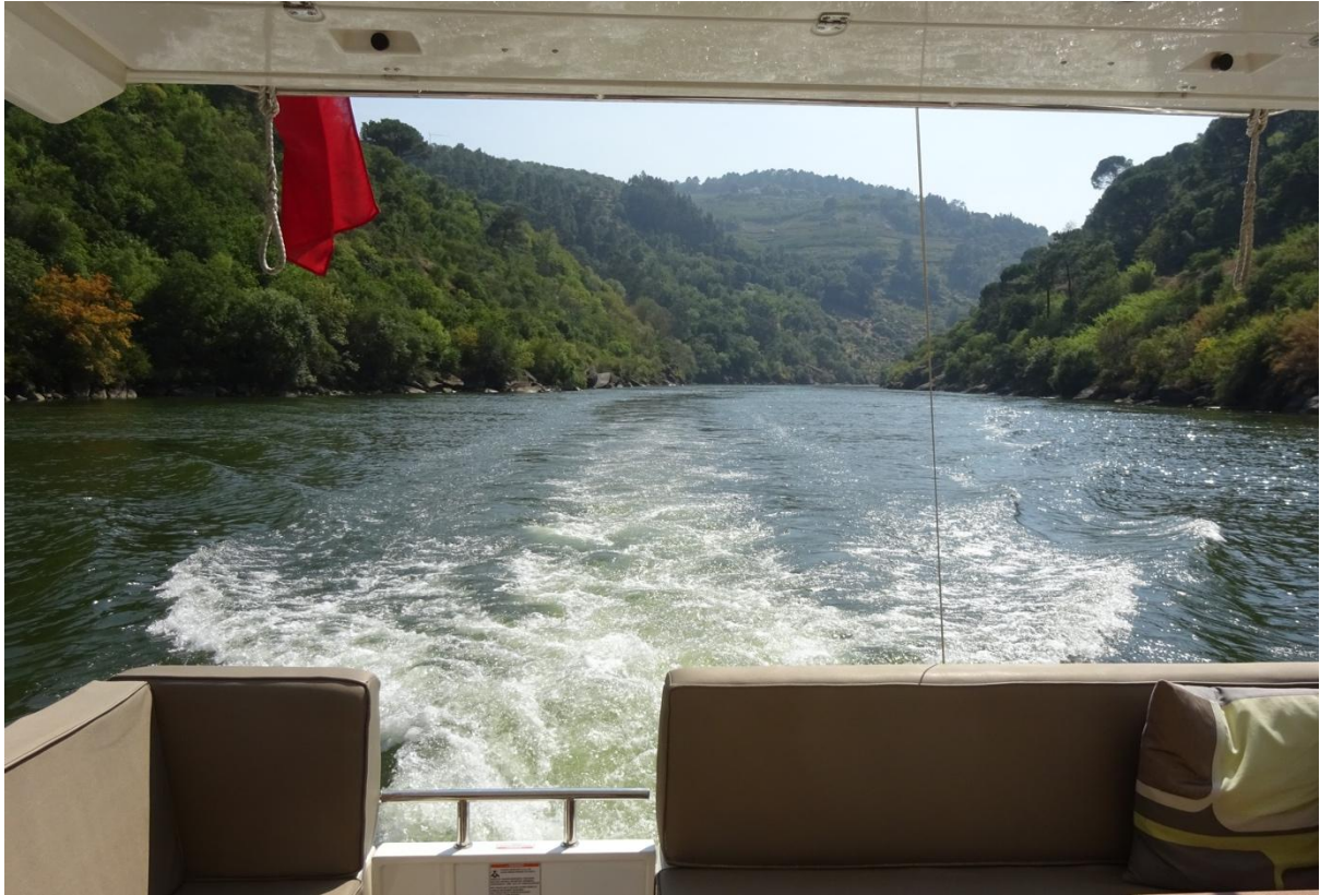
Progressing up the Douro

The only real difficulty was finding a berth for the night, the river is geared up for commercial pleasure craft including huge river cruisers but not private boats. One night we begged and pleaded to be allowed to spend the night on a berth associated with a very grand residence, they agreed and were so good to us.