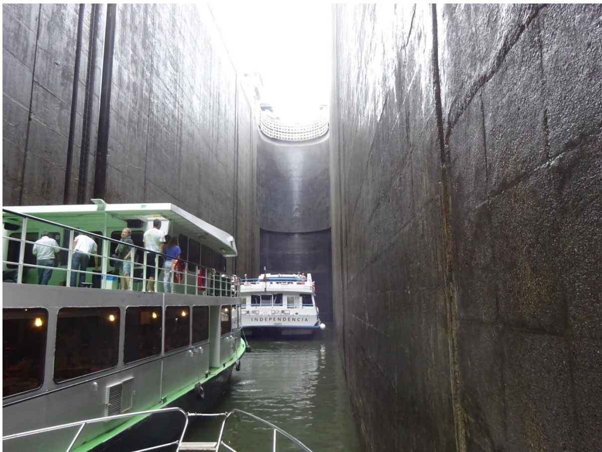
River Douro Lock

Arrived in Porto to a very well run and friendly marina who even delivered fresh bread rolls before breakfast every morning. Now to try and organise our trip up the Douro River where I knew it was necessary to book the locks in advance. I had tried to do research on this at home but not got very far. Signed up to websites, received links, received codes but still could not book locks. Phone calls not answered and e mails not replied to. Off to the marina office and they offered to do it for me and 3 hours later I had my lock bookings starting the next morning and I was ready to go.