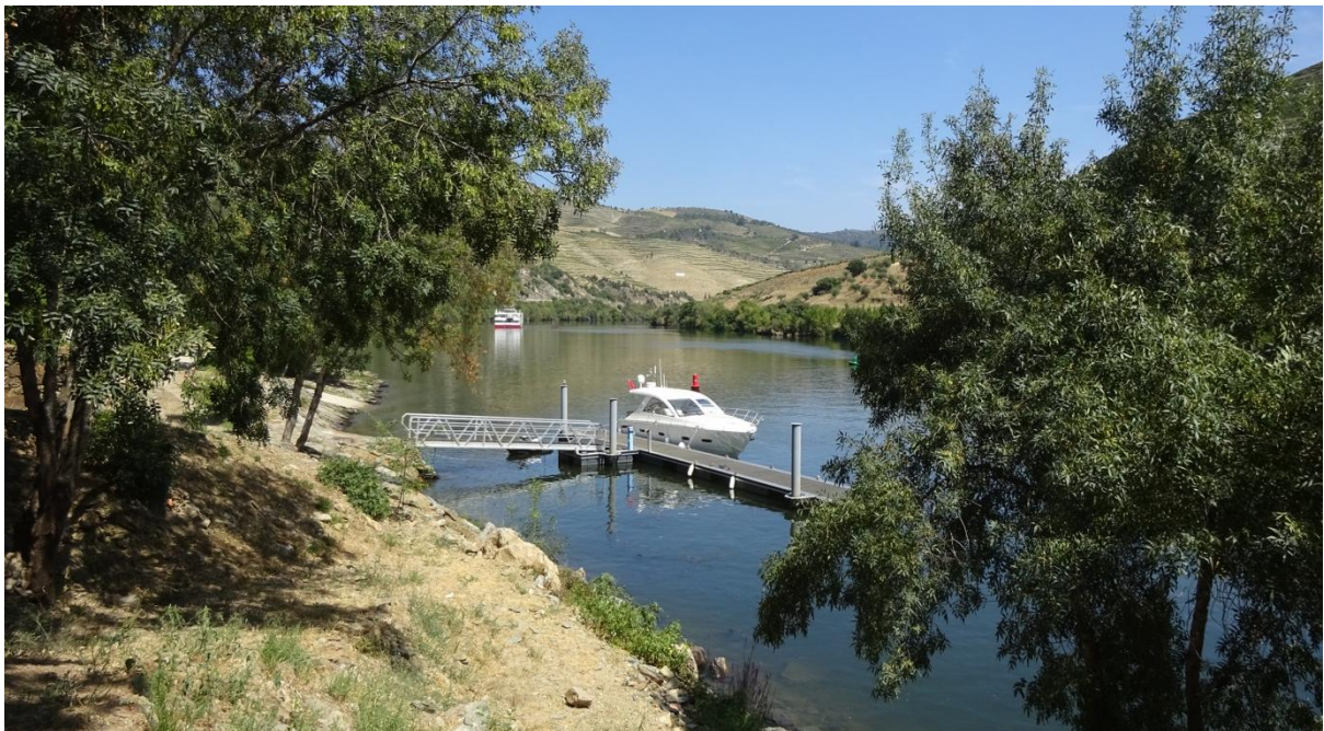
A perfect berth

The only real difficulty was finding a berth for the night, the river is geared up for commercial pleasure craft including huge river cruisers but not private boats. One night we begged and pleaded to be allowed to spend the night on a berth associated with a very grand residence, they agreed and were so good to us.